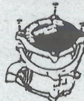
MERRILL STORMLAKE WC