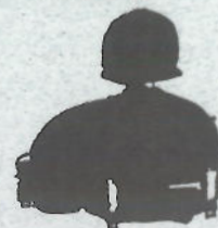
MONITOR CAP & VENT