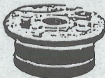
SINGLE JET WELL SEAL