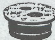
DOUBLE JET WELL SEAL